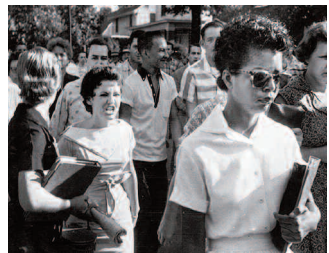
1957 Eisenhower orders federal troops to Little Rock to desegregate Central High School.