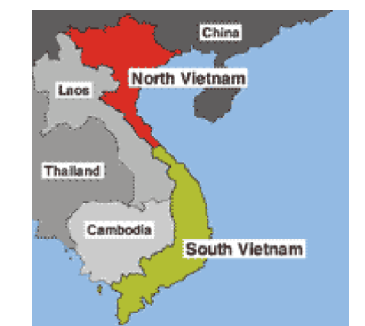
1964 Congress passes Gulf of Tonkin Resolution authorizing use of military force in Southeast Asia.

1961 Freedom rides attempt to integrate buses and bus stations in the deep South, as required by Boynton v. Virginia.